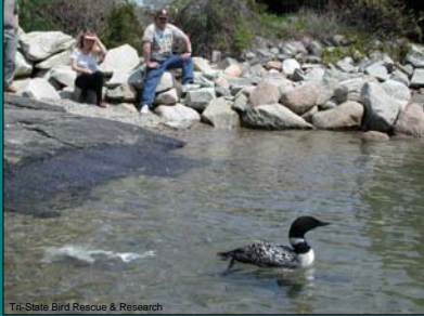
Tri-State Bird Rescue & Research